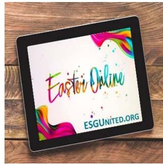
Facebook Live Vimeo, You Tube