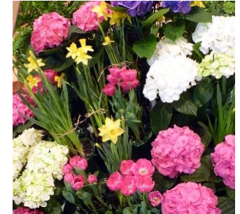
Mail - Easter Cards ESG Angels, Pastoral Care, Family Ministry