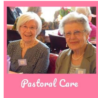
Phone 100+ Seniors