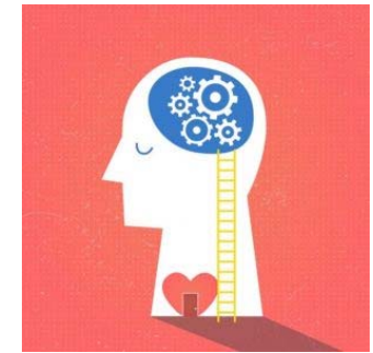
Feeling Better COVID Anxiety video