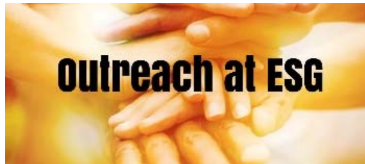
Emergency Funding for organizations