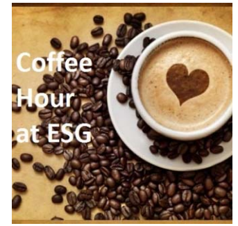
Zoom Coffee Hour