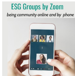
Zoom: Youth, Book Club, WWIT