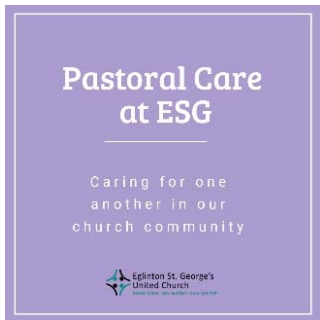
Care for 100+ seniors Pastoral Care, ESG Angels