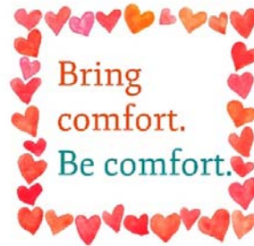
We are not alone Tuesday email